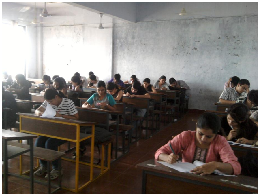
Credence academy banner (left) and students taking the test (right)