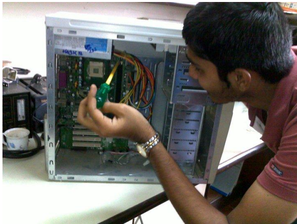
Participant, dismantling the CPU